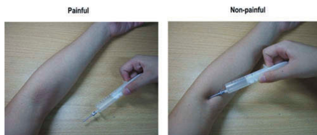
Figure 1. Illustration of a painful and a non-painful stimulus used in the current study.

Participants were presented with images of others' hands receiving painful and non-painful stimuli while an electroencephalogram (EEG) was recorded. There were 9 blocks of 80 trials for each participant. After reading one essay, EEG was recorded during three blocks of trials. The order of reading essays for independent, interdependent, and control priming was counterbalanced across participants. Each block started with the presentation of instructions for 3 s followed by 80 trials. On each trial, a painful or non-painful stimulus was presented for 200 ms at the center of the screen, which was followed by a fixation cross with a duration varying randomly between 800 and 1600 ms. Painful and non-painful stimuli were presented in a random order. Participants were asked to judge whether or not the target felt pain by a button press using the left or right index finger. The assignment of the left or right index finger to the painful and non-painful stimuli and the order of the priming procedure were counterbalanced across participants. Participants completed the Interpersonal Reactivity Index (IRI) to measure their trait-level empathy (Davis, 1983) after EEG recording. ERP recording and analysis were similar to those in our previous work (Fan & Han, 2008). Mean amplitudes of each ERP component were calculated at frontal (Fz, FCz, F3–F4, FC3–FC4), central (Cz, CPz, C3–C4, CP3–CP4), and parietal (Pz, P3–P4) electrodes.